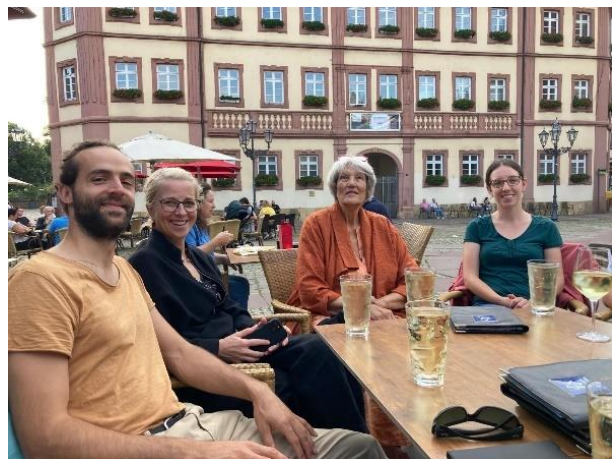
Workshop with spritzer.

An encore that was challenging at the beginning, but ultimately very enriching was the participation of a diploma student from Belgium. The fact that the exchange within TCI can also work on the basis of solid school English was a encouraging surprise.