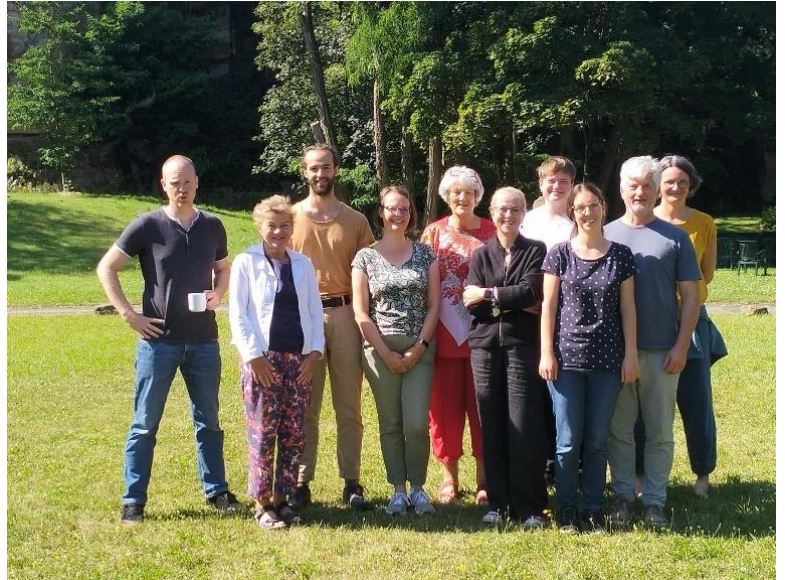
CWS in Neustadt an der Weinstraße

Setting personal goals, prioritising them and pouring them into a condensed curriculum on a DIN A4 page requires a high degree of self-reflection and a prophetic gift at the same time. Especially since it is flanked by extensive training and examination guidelines. Many a digression in these days was more about the global view of TCI and its future than about one's own diploma. This self-centred focus sometimes had an irritating effect, as the becoming of the "we" otherwise plays such a central role in TCI modules. However, the group successfully helped itself with seminar-tested games - and a very pleasant evening together on the market square with tarte flambée and wine spritzers.