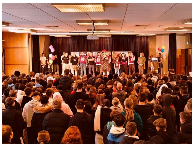
Colourful event at the school.