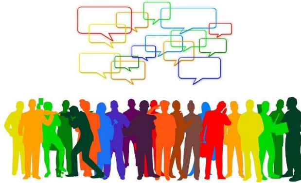
TCI exchange in Cologne

All interested parties will have the opportunity to meet and exchange ideas in a cosy atmosphere on the evening before, 14 March 2025.