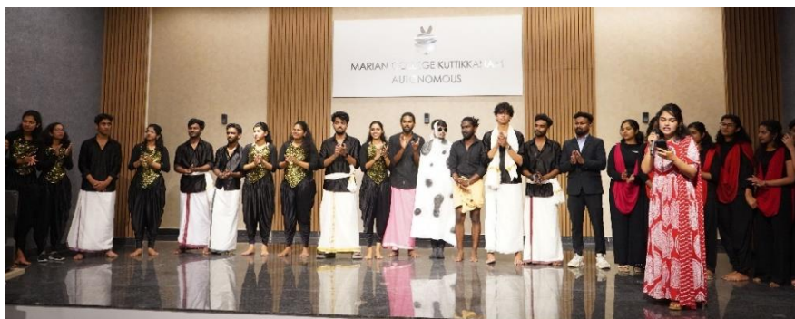
Cultural programme by students of Marian College