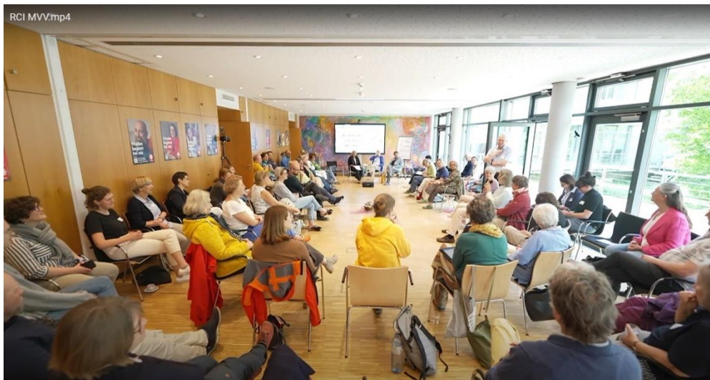
General Meeting RCI Dreyeckland