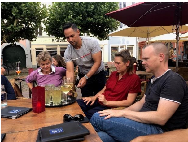
Cheers to the Palatinate.