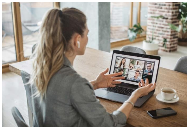
Digital.alive.

The first study in the German-speaking world on interaction in virtual meetings - COME-Cooperative Meetings - shows that virtual communication needs more than functional technology. It requires conscious design, mindfulness and the willingness to break old patterns. We are still at the beginning of learning how real encounters in the digital space - beyond monologues, distractions and fatigue.