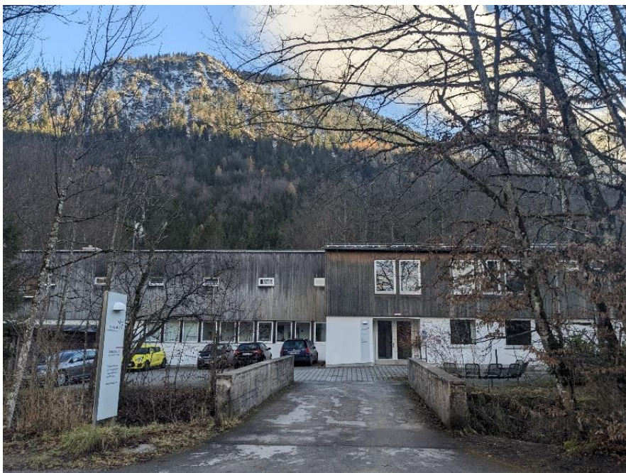
Josefstal Study Centre with a view.